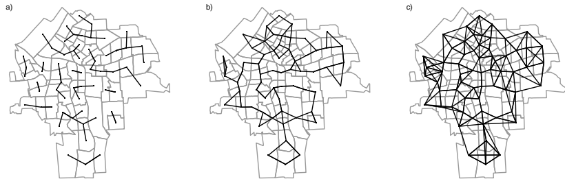
Figure 3: (a) k = 1 neighbours; (b) k = 2 neighbours; (c) k = 4 neighbours

representation of the spatial weights can become block-diagonal if observations are appropriately sorted.