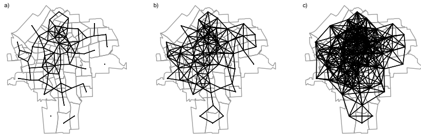
Figure 5: Distance-based neighbours: frequencies of numbers of neighbours by census tract

no-neighbour areal entities, the distance criterion will need to be set such that many areas have many neighbours. Figure 5 shows the counts of sizes of sets of neighbours for the three different distance limits. In Syracuse, the census tracts are of similar areas, but were we to try to use the distance-based neighbour criterion on the eight-county study area, the smallest distance securing at least one neighbour for every areal entity is over 38 km.